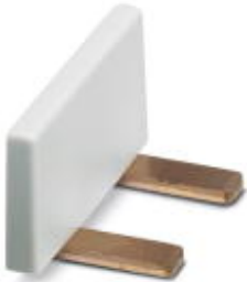
Insertion bridge, pitch: 17.8 mm, number of positions: 2, color: light gray

Please be informed that the data shown in this PDF Document is generated from our Online Catalog. Please find the complete data in the user's documentation. Our General Terms of Use for Downloads are valid ( http://phoenixcontact.com/download )