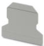
Partition plate, length: 56 mm, width: 1.5 mm, height: 45.7 mm, color: gray