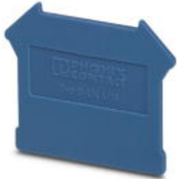
End cover, length: 42.5 mm, width: 1.8 mm, height: 47 mm, color: blue

Please be informed that the data shown in this PDF Document is generated from our Online Catalog. Please find the complete data in the user's documentation. Our General Terms of Use for Downloads are valid ( http://phoenixcontact.com/download )