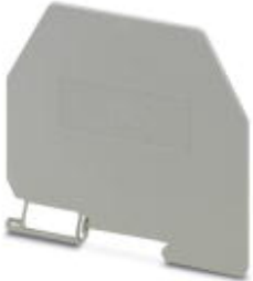
Partition plate, Length: 99 mm, Width: 2 mm, Height: 90 mm, Color: gray

Please be informed that the data shown in this PDF Document is generated from our Online Catalog. Please find the complete data in the user's documentation. Our General Terms of Use for Downloads are valid ( http://phoenixcontact.com/download )