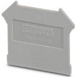
End cover, Length: 42.5 mm, Width: 1.8 mm, Height: 35.9 mm, Color: gray

Please be informed that the data shown in this PDF Document is generated from our Online Catalog. Please find the complete data in the user's documentation. Our General Terms of Use for Downloads are valid ( http://phoenixcontact.com/download )