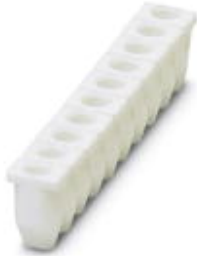
Insulating sleeve, color: white

Please be informed that the data shown in this PDF Document is generated from our Online Catalog. Please find the complete data in the user's documentation. Our General Terms of Use for Downloads are valid ( http://phoenixcontact.com/download )