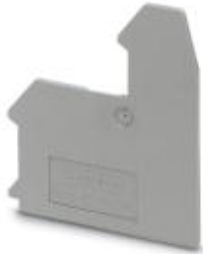
End cover, length: 47.5 mm, width: 1.5 mm, height: 58.5 mm, color: gray

Please be informed that the data shown in this PDF Document is generated from our Online Catalog. Please find the complete data in the user's documentation. Our General Terms of Use for Downloads are valid ( http://phoenixcontact.com/download )