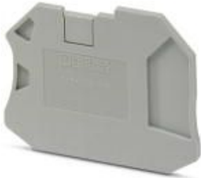
End cover, length: 57.8 mm, width: 2.2 mm, height: 47.5 mm, color: gray

Please be informed that the data shown in this PDF Document is generated from our Online Catalog. Please find the complete data in the user's documentation. Our General Terms of Use for Downloads are valid ( http://phoenixcontact.com/download )