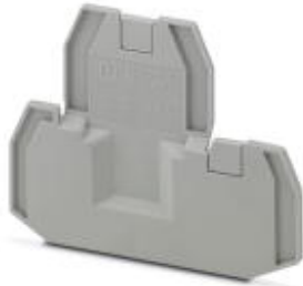
End cover, length: 75.6 mm, width: 2.2 mm, height: 57.5 mm, color: gray

Please be informed that the data shown in this PDF Document is generated from our Online Catalog. Please find the complete data in the user's documentation. Our General Terms of Use for Downloads are valid ( http://phoenixcontact.com/download )