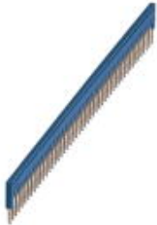
Plug-in bridge, pitch: 3.5 mm, number of positions: 50, color: blue

Please be informed that the data shown in this PDF Document is generated from our Online Catalog. Please find the complete data in the user's documentation. Our General Terms of Use for Downloads are valid ( http://phoenixcontact.com/download )