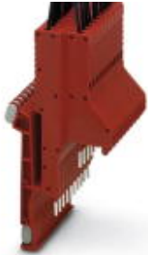
Test plugs, color: red

Please be informed that the data shown in this PDF Document is generated from our Online Catalog. Please find the complete data in the user's documentation. Our General Terms of Use for Downloads are valid ( http://phoenixcontact.com/download )