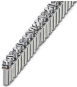
Fixed bridge, number of positions: 20, color: silver

Please be informed that the data shown in this PDF Document is generated from our Online Catalog. Please find the complete data in the user's documentation. Our General Terms of Use for Downloads are valid ( http://phoenixcontact.com/download )