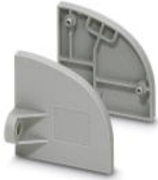
Flange, number of positions: 0, color: gray

Please be informed that the data shown in this PDF Document is generated from our Online Catalog. Please find the complete data in the user's documentation. Our General Terms of Use for Downloads are valid ( http://phoenixcontact.com/download )