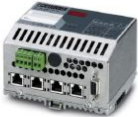
Proxy for PROFINET-RT-IRT, G4 functionality, INTERBUS proxy with integrated 4-port switch

Please be informed that the data shown in this PDF Document is generated from our Online Catalog. Please find the complete data in the user's documentation. Our General Terms of Use for Downloads are valid ( http://phoenixcontact.com/download )