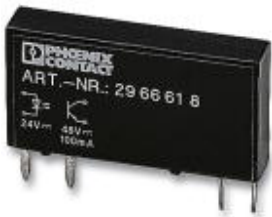
The illustration shows the version OPT-24DC/48DC/100

Plug-in miniature solid-state relay, input solid-state relay, 1 N/O contact, input voltage: 5 V DC