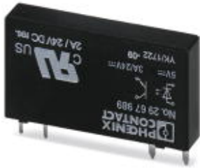
Plug-in miniature solid-state relay, power solid-state relay, 1 N/O contact, input voltage: 5 V DC

Please be informed that the data shown in this PDF Document is generated from our Online Catalog. Please find the complete data in the user's documentation. Our General Terms of Use for Downloads are valid ( http://phoenixcontact.com/download )