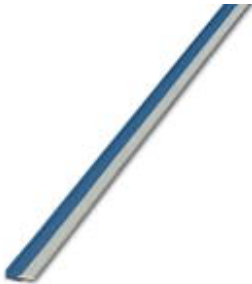
Continuous plug-in bridge, length: 500 mm, color: blue

Please be informed that the data shown in this PDF Document is generated from our Online Catalog. Please find the complete data in the user's documentation. Our General Terms of Use for Downloads are valid ( http://phoenixcontact.com/download )