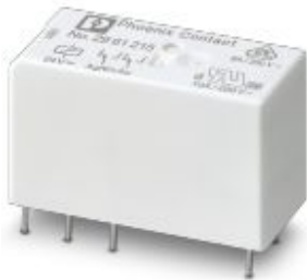
Plug-in miniature power relay, with multi-layer gold contact, 2 PDTs, input voltage 24 V DC

Please be informed that the data shown in this PDF Document is generated from our Online Catalog. Please find the complete data in the user's documentation. Our General Terms of Use for Downloads are valid ( http://phoenixcontact.com/download )