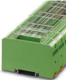
Diode module, for extension with 14 1N 4007 diodes, with a common cathode

Please be informed that the data shown in this PDF Document is generated from our Online Catalog. Please find the complete data in the user's documentation. Our General Terms of Use for Downloads are valid ( http://phoenixcontact.com/download )