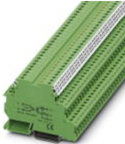
Power solid-state relay terminal block, input: 24 V DC, output: 3 - 30 V DC/3 A, terminal block width: 6.2 mm

Please be informed that the data shown in this PDF Document is generated from our Online Catalog. Please find the complete data in the user's documentation. Our General Terms of Use for Downloads are valid ( http://phoenixcontact.com/download )