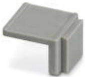
Equipment marker, narrow

Marking material - EMG-SGKS 10 - 2947585