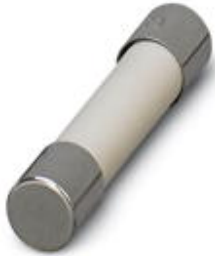
Output fuse (5x20 mm) acc. to IEC 127-2/EN 60127-2, 2 A fast blow

Please be informed that the data shown in this PDF Document is generated from our Online Catalog. Please find the complete data in the user's documentation. Our General Terms of Use for Downloads are valid ( http://phoenixcontact.com/download )