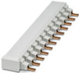
Bus bar for TMC 82... circuit breakers with auxiliary contact module

Please be informed that the data shown in this PDF Document is generated from our Online Catalog. Please find the complete data in the user's documentation. Our General Terms of Use for Downloads are valid ( http://phoenixcontact.com/download )