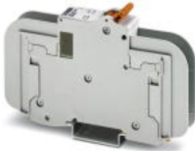
Thermomagnetic device circuit breaker, number of positions: 1, width: 17.6 mm, mounting type: DIN rail: 35 mm, Color: gray

Please be informed that the data shown in this PDF Document is generated from our Online Catalog. Please find the complete data in the user's documentation. Our General Terms of Use for Downloads are valid ( http://phoenixcontact.com/download )