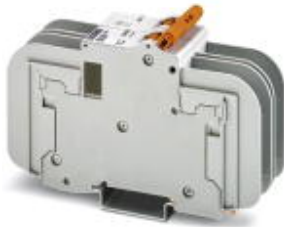
Thermomagnetic device circuit breaker, number of positions: 2, width: 35.3 mm, mounting type: DIN rail, Color: gray

Please be informed that the data shown in this PDF Document is generated from our Online Catalog. Please find the complete data in the user's documentation. Our General Terms of Use for Downloads are valid ( http://phoenixcontact.com/download )