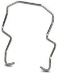
Relay retaining bracket, wire model, suitable for RIF-1 relay base, for 25 mm high octal miniature power relays

Please be informed that the data shown in this PDF Document is generated from our Online Catalog. Please find the complete data in the user's documentation. Our General Terms of Use for Downloads are valid ( http://phoenixcontact.com/download )