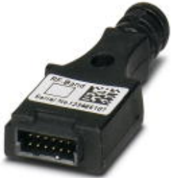
Radioline - memory stick for saving custom configuration data

Please be informed that the data shown in this PDF Document is generated from our Online Catalog. Please find the complete data in the user's documentation. Our General Terms of Use for Downloads are valid ( http://phoenixcontact.com/download )