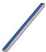
Continuous plug-in bridge, length: 500 mm, color: blue

Continuous plug-in bridge - FBST 500-PLC BU - 2966692