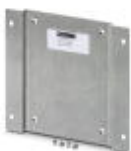
Mounting plate for SFNT switches

Mounting plate - FL PA SFNT 5-8 - 2891012