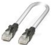
Patch cable, CAT5, assembled, 2 m

Patch cable - FL CAT5 PATCH 2,0 - 2832289