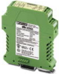
Analog extension module with 4 analog current outputs 4 mA ... 20mA

Please be informed that the data shown in this PDF Document is generated from our Online Catalog. Please find the complete data in the user's documentation. Our General Terms of Use for Downloads are valid ( http://phoenixcontact.com/download )