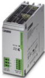
Primary-switched TRIO POWER power supply for DIN rail mounting, input: 1-phase, output: 48 V DC/5 A

Please be informed that the data shown in this PDF Document is generated from our Online Catalog. Please find the complete data in the user's documentation. Our General Terms of Use for Downloads are valid ( http://phoenixcontact.com/download )