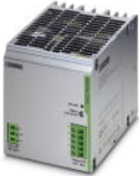
Primary-switched TRIO POWER power supply for DIN rail mounting, input: 1-phase, output: 24 V DC/20 A

Please be informed that the data shown in this PDF Document is generated from our Online Catalog. Please find the complete data in the user's documentation. Our General Terms of Use for Downloads are valid ( http://phoenixcontact.com/download )