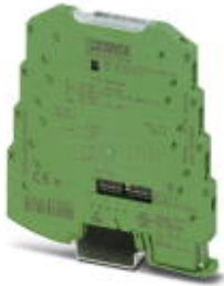
MCR temperature transducer, configurable, for Pt 100 temperature sensors, with screw-connection, not configured

Please be informed that the data shown in this PDF Document is generated from our Online Catalog. Please find the complete data in the user's documentation. Our General Terms of Use for Downloads are valid ( http://phoenixcontact.com/download )