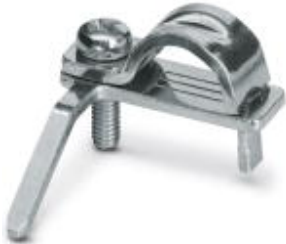
Shield connection clip for printed circuit terminal block

Please be informed that the data shown in this PDF Document is generated from our Online Catalog. Please find the complete data in the user's documentation. Our General Terms of Use for Downloads are valid ( http://phoenixcontact.com/download )