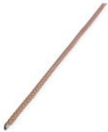
Wiring bridge for modules with connecting pitch 17.5 mm, 1-phase, 57-pos.

Please be informed that the data shown in this PDF Document is generated from our Online Catalog. Please find the complete data in the user's documentation. Our General Terms of Use for Downloads are valid ( http://phoenixcontact.com/download )