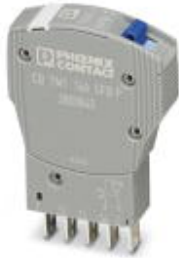
Thermomagnetic device circuit breaker, 1-pos., tripping characteristic SFB, 1 PDT contact, plug for base element.

Please be informed that the data shown in this PDF Document is generated from our Online Catalog. Please find the complete data in the user's documentation. Our General Terms of Use for Downloads are valid ( http://phoenixcontact.com/download )