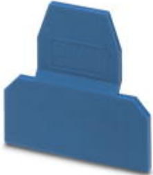
End cover, Length: 56 mm, Width: 2.5 mm, Height: 62 mm, Color: blue

Please be informed that the data shown in this PDF Document is generated from our Online Catalog. Please find the complete data in the user's documentation. Our General Terms of Use for Downloads are valid ( http://phoenixcontact.com/download )