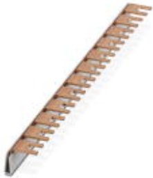
Wiring bridge for modules with connecting pitch 17.5 mm, 1-phase, 12-pos.

Please be informed that the data shown in this PDF Document is generated from our Online Catalog. Please find the complete data in the user's documentation. Our General Terms of Use for Downloads are valid ( http://phoenixcontact.com/download )