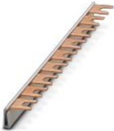
Wiring bridge for modules with connecting pitch 17.5 mm, 1-phase, 9-pos.

Please be informed that the data shown in this PDF Document is generated from our Online Catalog. Please find the complete data in the user's documentation. Our General Terms of Use for Downloads are valid ( http://phoenixcontact.com/download )