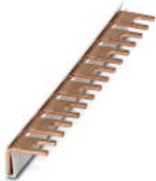
Wiring bridge for modules with connecting pitch 17.5 mm, 1-phase, 8-pos.

Please be informed that the data shown in this PDF Document is generated from our Online Catalog. Please find the complete data in the user's documentation. Our General Terms of Use for Downloads are valid ( http://phoenixcontact.com/download )