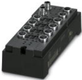
VersaMax IP modular device, 8 digital inputs, M12 fast connection

Please be informed that the data shown in this PDF Document is generated from our Online Catalog. Please find the complete data in the user's documentation. Our General Terms of Use for Downloads are valid ( http://phoenixcontact.com/download )