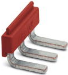
Insertion bridge, pitch: 6.15 mm, number of positions: 3, color: red

Please be informed that the data shown in this PDF Document is generated from our Online Catalog. Please find the complete data in the user's documentation. Our General Terms of Use for Downloads are valid ( http://phoenixcontact.com/download )