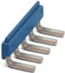
Insertion bridge, pitch: 6.15 mm, number of positions: 5, color: blue

Please be informed that the data shown in this PDF Document is generated from our Online Catalog. Please find the complete data in the user's documentation. Our General Terms of Use for Downloads are valid ( http://phoenixcontact.com/download )