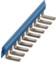
Insertion bridge, pitch: 6.2 mm, number of positions: 80, color: blue

Please be informed that the data shown in this PDF Document is generated from our Online Catalog. Please find the complete data in the user's documentation. Our General Terms of Use for Downloads are valid ( http://phoenixcontact.com/download )