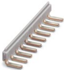
Insertion bridge, pitch: 6.15 mm, number of positions: 10, color: gray

Please be informed that the data shown in this PDF Document is generated from our Online Catalog. Please find the complete data in the user's documentation. Our General Terms of Use for Downloads are valid ( http://phoenixcontact.com/download )