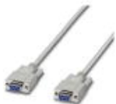
RS-232 cable, 9-pos. D-SUB socket on 9-pos. D-SUB socket, 9-wire, 1:1

Data cable - PSM-KA9SUB9/BB/2METER - 2799474