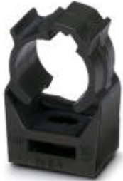
Mounting clamp for fastening the FL LCX CABLE METER leaky wave conductor.

Please be informed that the data shown in this PDF Document is generated from our Online Catalog. Please find the complete data in the user's documentation. Our General Terms of Use for Downloads are valid ( http://phoenixcontact.com/download )