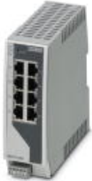
Managed Switch 2000, 8 RJ45 ports 10/100 Mbps, Degree of protection IP20

Please be informed that the data shown in this PDF Document is generated from our Online Catalog. Please find the complete data in the user's documentation. Our General Terms of Use for Downloads are valid ( http://phoenixcontact.com/download )