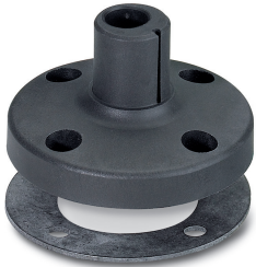
Foot for tube Ø 25 mm, plastic, black

Please be informed that the data shown in this PDF Document is generated from our Online Catalog. Please find the complete data in the user's documentation. Our General Terms of Use for Downloads are valid ( http://phoenixcontact.com/download )